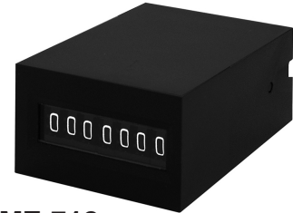
MZ-712 Rear / Terminal Pins