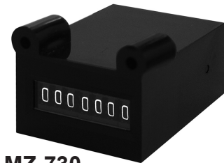
MZ-730 Behind Panel (Screw) / Leadwire